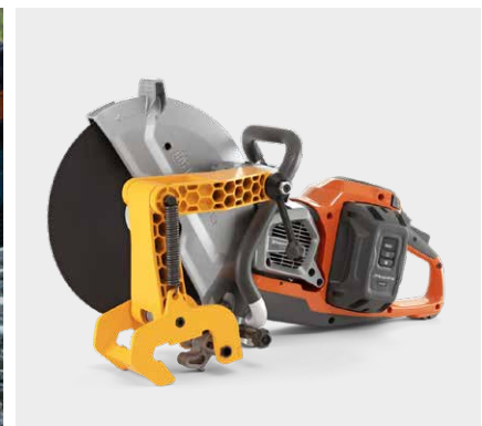
FKM GREENTEC A-TSG 350 battery-powered rail cut-off grinder